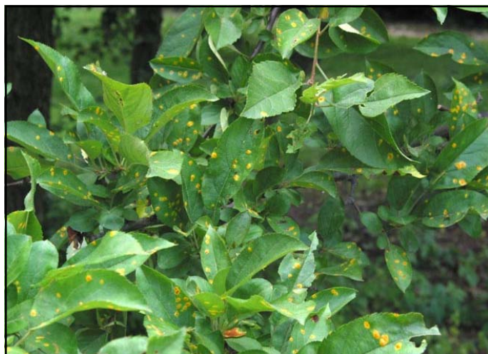
Figure 2: Apple leaves displaying bright yellow-orange leaf lesions.

rosaceous hosts are apple, crabapple, hawthorn, quince, serviceberry, and pear. Some commercial apple varieties are also highly susceptible to cedar-apple rust; fruit may be infected by the fungus, and infected leaves may drop prematurely causing potentially severe defoliation.