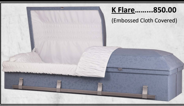
K Flare.....850.00 (Embossed Cloth Covered)