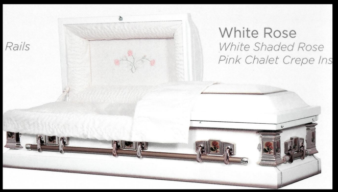
White Rose White Shaded Rose Pink Chalet Crepe Ins

Ask about our various ceremonial rental casket options