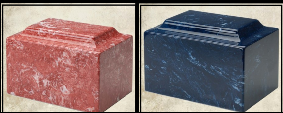
Cultured Marble Urns.....250.00

Ask about our various ceremonial rental casket options