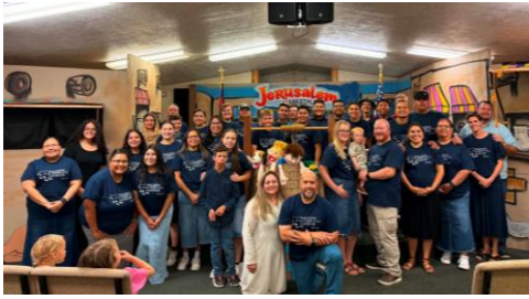
Helping at VBS