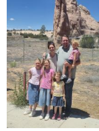
Enjoying family time