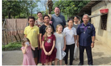
Last Sunday before leaving for furlough