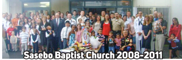
Sasebo Baptist Church 2008-2011