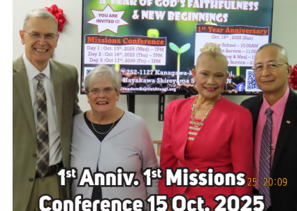
1st Anniv. 1st Missions Conference 15 Oct. 2025