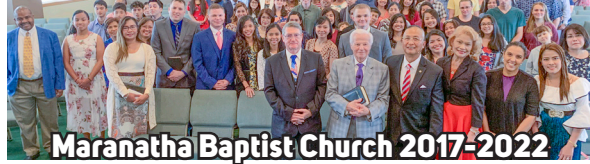
Maranatha Baptist Church 2017-2022