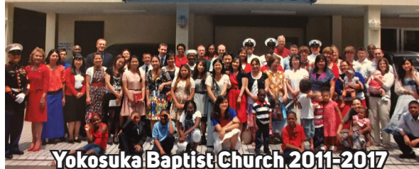
Yokosuka Baptist Church 2011-2017