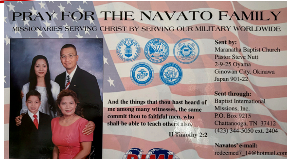
Our first Deputation Prayer Card 2002-2005