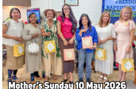
Mother's Sunday 10 May 2026