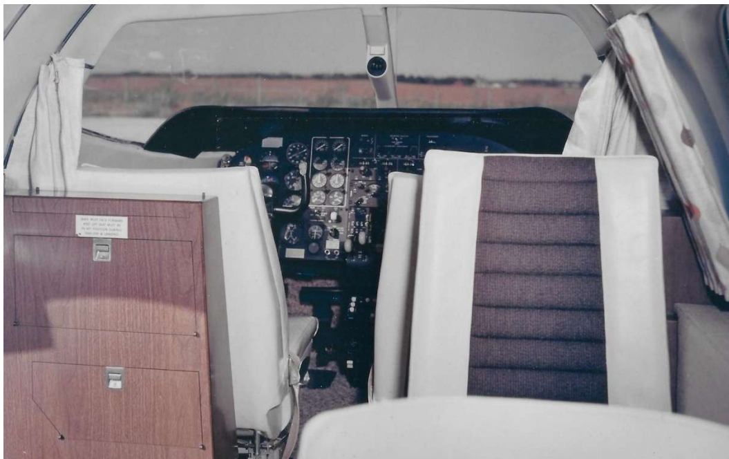
Only Known Color Photo of 23-003 Interior