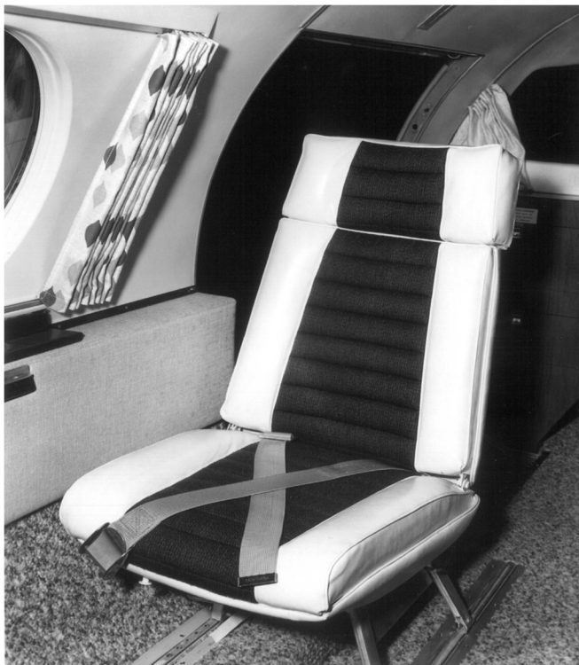
23-003 Left Front Passenger Seat