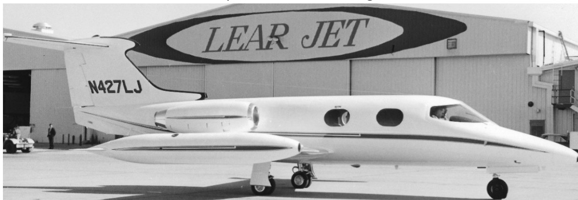
1 st Model 24 - 24-100 N427LJ

The Model 24 was certified on Saint Patrick’s Day, March 17, 1966. It was the very first airplane certified to the then new FAR Part 25. A new 1966 M24 cost $649,000. That price included all electronics, custom interior, external paint and crew training!