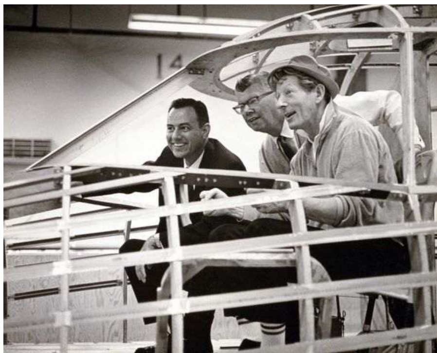
Clay Lacy, Bill Lear and Danny Kaye in Lear Liner Mockup

This famous picture was taken of Clay Lacy and Danny Kaye 'at the controls' of the Model 40 Lear Liner mockup and being supervised by Bill Lear.