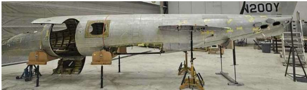
Fuselage Ready for Final Leveling

We are completing the final leveling of the fuselage and securing the supports. This will allow us to remove damaged fuselage skins. With these skins removed, Non-Destructive Inspections (NDI) can continue in order to provide us additional data on the fuselage structural integrity.