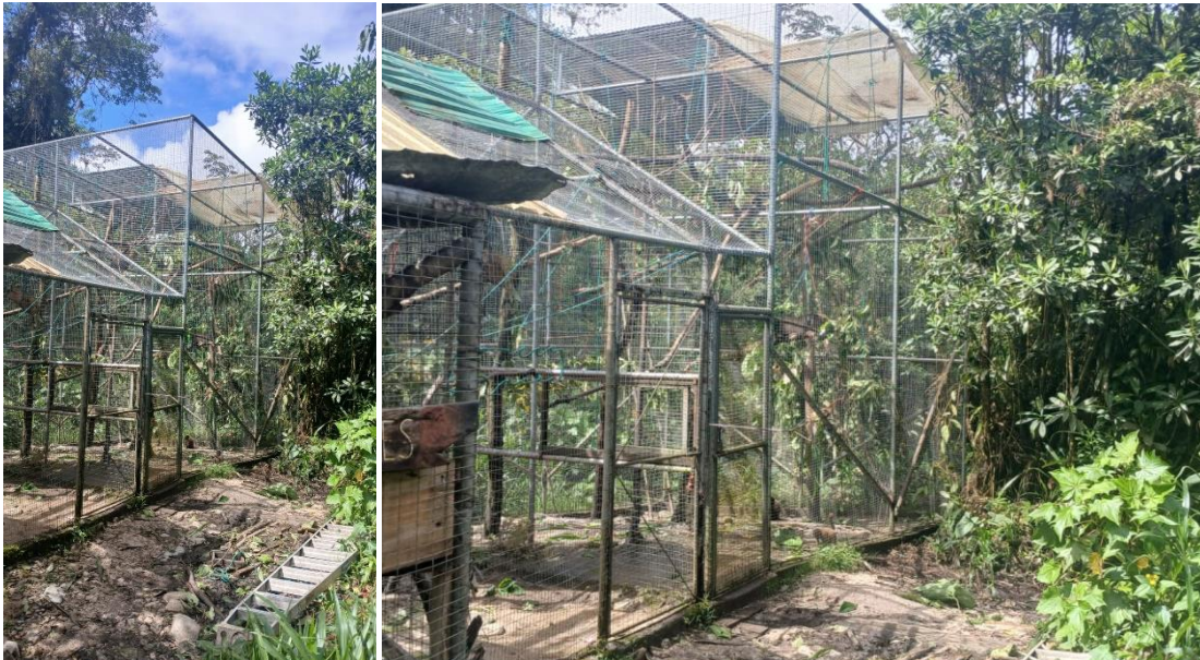
The new extension of the enclosure for young woolly monkeys is now twice as large.