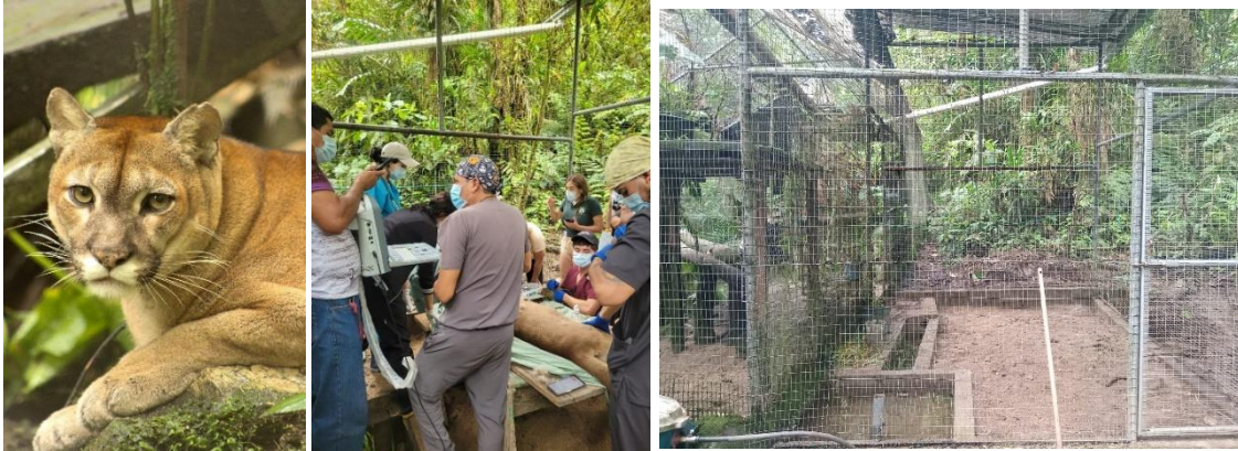
Despite her advanced age, Pangui is in excellent health. Her enclosure has been extended.