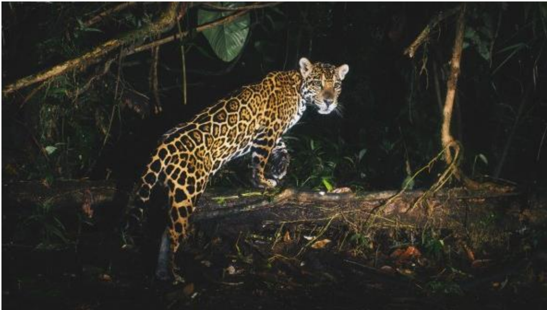
Spectacular footage of a wild jaguar in the Merazonia reserve captured with a motion camera.

De bouw van een nieuwe quarantaine zal het belangrijkste doel zijn voor 2025. Het gedetailleerde gezondheidsplan van Merazonia kan hier worden gedownload: https://www.merazonia.org/er