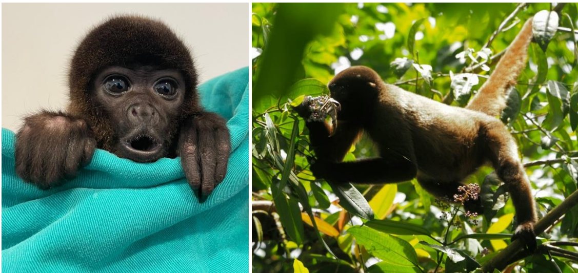
Little monkeys grow up. With the right care and guidance, they can return to the jungle.

Not only for the howler monkeys, but also for the woolly monkeys. Because three groups have already been released here. The last group was successfully released at the beginning of December. Before this, extensive blood tests were carried out at the foundation's expense to ensure that these animals were free of disease. The same tests have already been carried out for the group of five red howler monkeys that will be released in 2025.