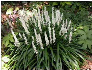
Liriope 'Monroe White'