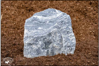
Granite Boulder rocks