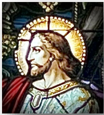
Bishop Barres Visit