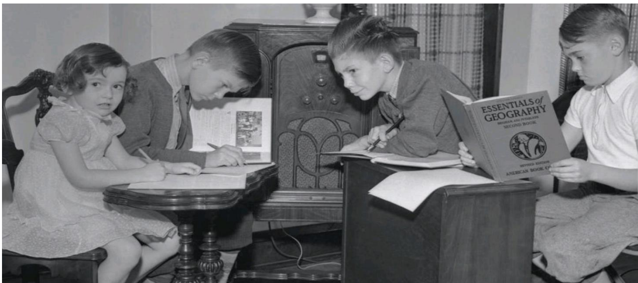
Remote learning isn't new: during the polio outbreak in 1937, some 315,000 children benefitted from education from home via the wireless.