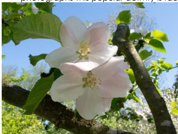
Apple Blossom in the community orchard