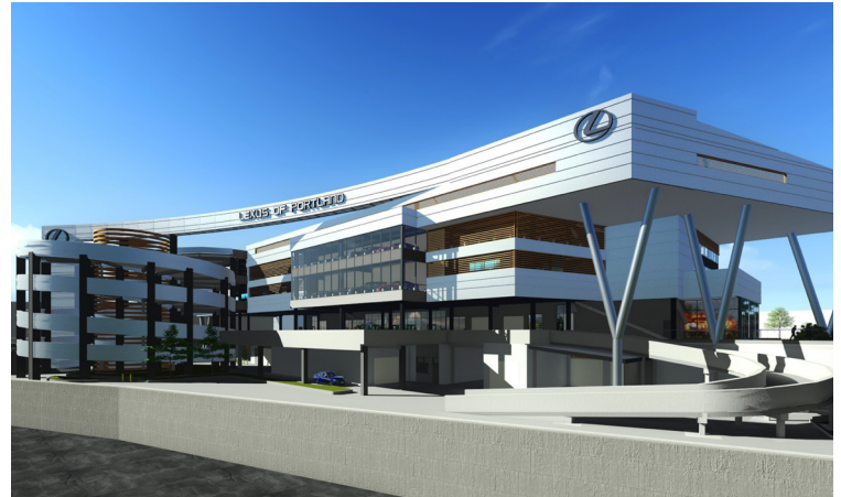
In the four-story urban Lexus of Portland dealership, buyers will 'Experience Amazing'

"Ideate Software set the bar for quality as well as responsiveness."