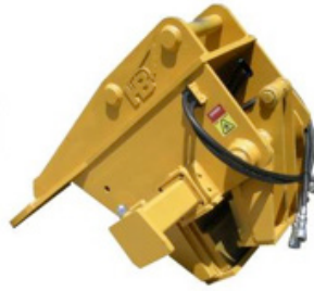
PLATYPUS - CLIP PUSHER