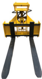
ADJUSTABLE FORK GRAB

To simplify and speed up the safe laying of concrete sleepers for rail and tram networks. The Octopus 4 is suited for a min 12 ton excavator, the Octopus 6 is suited for a min 16 ton excavator and the Octopus 8 is suited for a min 30 ton excavator.