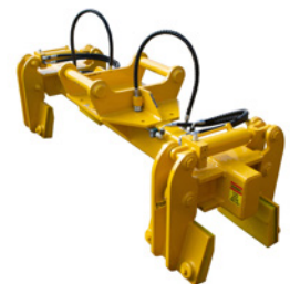
POINTS BEARER GRAB

An efficient method for unloading and moving sleeper stock up to 12 sleepers from a standard pack.