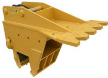
PLATYPUS - STANDARD