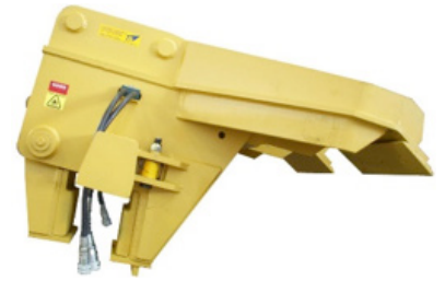
PLATYPUS - WIDE BLADE

Have been designed to simplify and speed up the safe replacement of railway sleepers. The grab picks up and side inserts concrete sleepers under the rail line. This product allows for a fast and efficient method and saves manual handling, time and money.