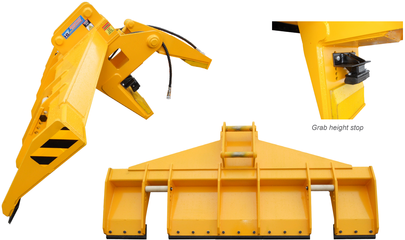
Grab height stop