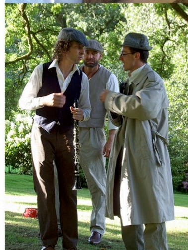
Photos from a previous Folksy production of A Midsummer Night's Dream