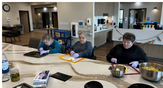
Making Potato Salad