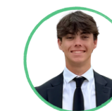
Anderson Reece Madison Academy