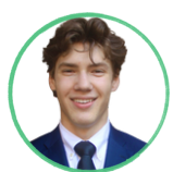
Houston Hall CALHOUN