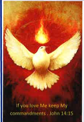
If you love Me keep My commandments. John 14:15

** Visit the parish website or scan the QR code at entrances, for more parish information and news of other catholic events.