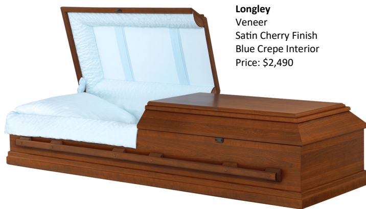
Longley Veneer Satin Cherry Finish Blue Crepe Interior Price: $2,490