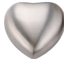
Pewter or Bronze Heart Classic metal keepsake urn $175 Stand $50