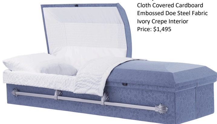
Kinsey Cloth Covered Cardboard Embossed Doe Steel Fabric Ivory Crepe Interior Price: $1,495