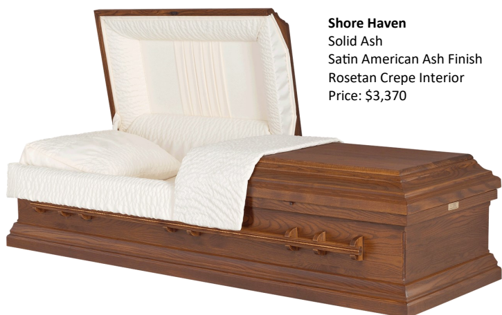
Shore Haven Solid Ash Satin American Ash Finish Rosetan Crepe Interior Price: $3,370