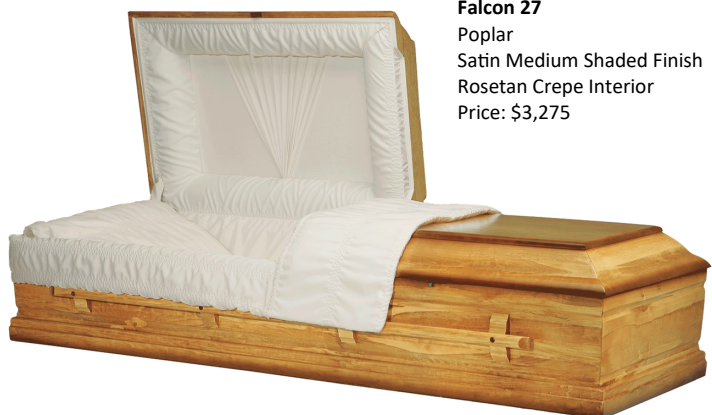
Falcon 27 Poplar Satin Medium Shaded Finish Rosetan Crepe Interior Price: $3,275