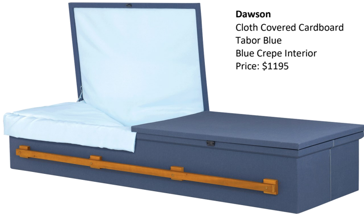
Dawson Cloth Covered Cardboard Tabor Blue Blue Crepe Interior Price: $1195

Cremation Identification Containers are not intended for use during a public visitation/viewing.