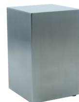
Segger - Pewter Finish Stainless steel - $250