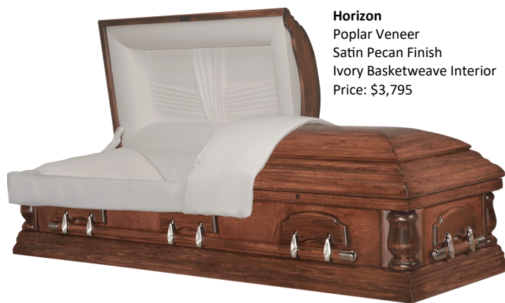
Horizon Poplar Veneer Satin Pecan Finish Ivory Basketweave Interior Price: $3,795

The Birmingham and Horizon caskets include your choice of Eternal Reflections Keepsake Corner Art, see corner book for all options