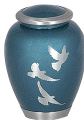
Cortina Aluminum keepsake urn $110