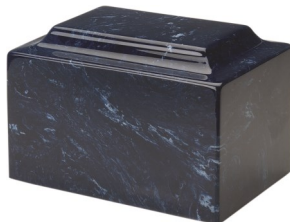
Kenzy Navy Cultured marble - $350