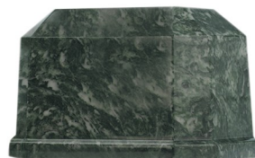
Green Marble Cultured marble keepsake urn $175