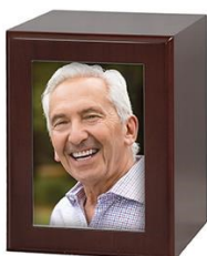
Paramount 4 x 6 photo veneer - $295