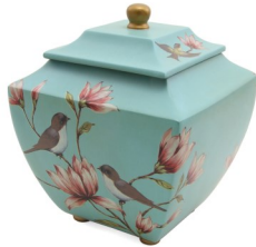
Magnolia Songbirds Resin - $475