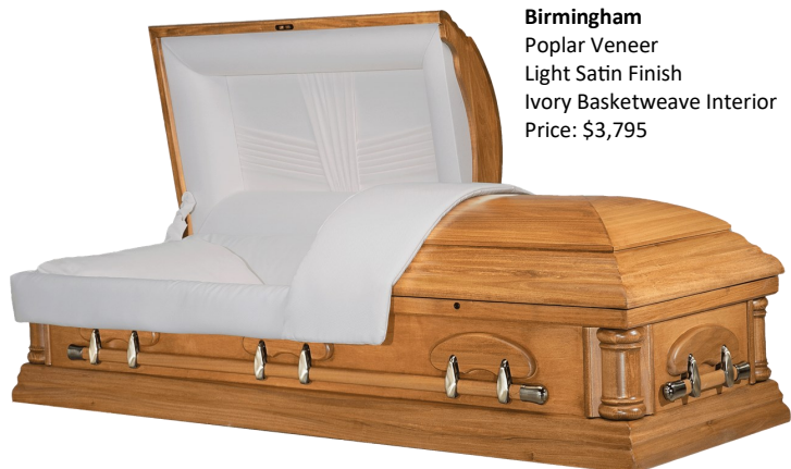
Birmingham Poplar Veneer Light Satin Finish Ivory Basketweave Interior Price: $3,795