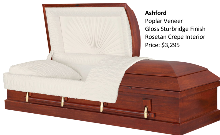
Ashford Poplar Veneer Gloss Sturbridge Finish Rosetan Crepe Interior Price: $3,295