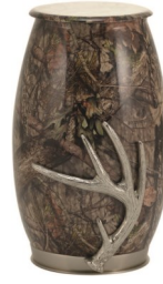
Frontier—Mossy Oak SST & Cast Brass - $475