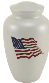
Classic Flag Brass - $450