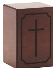
Veneer Cross Veneer - $250