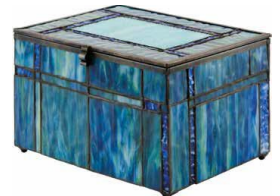
Seaside Hand crafted stain glass - $350