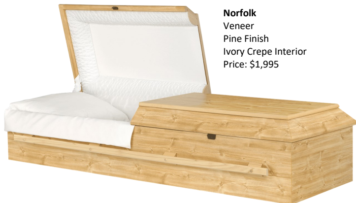
Norfolk Veneer Pine Finish Ivory Crepe Interior Price: $1,995