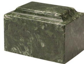
Kenzy Emerald Cultured marble - $350