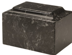
Kenzy Ebony Cultured marble - $350