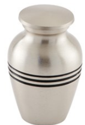
Brushed Pewter Brass keepsake urn $99