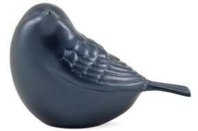
Frost Blue Songbird Solid brass keepsake urn $225