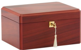
Renton Mahogany MDF w/mahogany veneer - $395