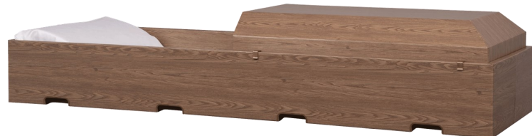
Danson Teakwood Woodgrain Cardboard White Crepe Interior Price: $695