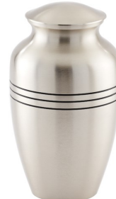
Brushed Pewter Classic metal - $350