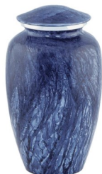
Marbled Indigo Aluminum - $250