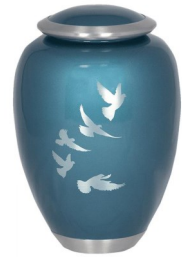
Cortina Aluminum - $475