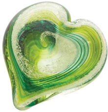
Celebration Glass Art Meadow Heart or Oceans Globe