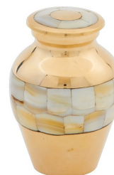
Mother of Pearl Brass keepsake urn $99