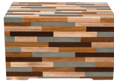
Tribute Repurposed wood - $595