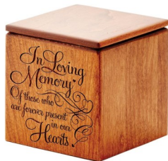
In Loving Memory Cherry keepsake urn $195