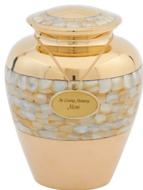
Mother of Pearl Classic metal - $350 (charm extra)