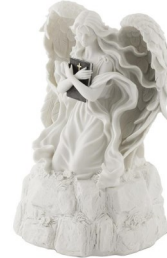
Angel Alabaster Composite - $475