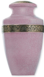
Milano Pink Brass - $475