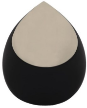
Kettering Aluminum & Stainless - $475

Personalization available on select urns and keepsake items - Range $50 - $75