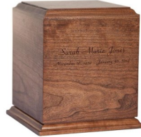
Avon Cherry Cherry - $475