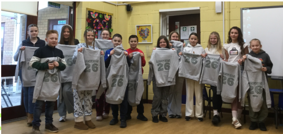
Our fabulous Year 6 children!