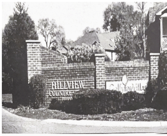
OUR 1999 ENTRANCE VIEW