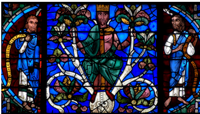
The Tree of Jesse, 12th c. Stained glass window, Chartres Cathedral, France

On that day the root of Jesse shall stand as a signal to the peoples; the nations shall inquire of him, and his dwelling shall be glorious.