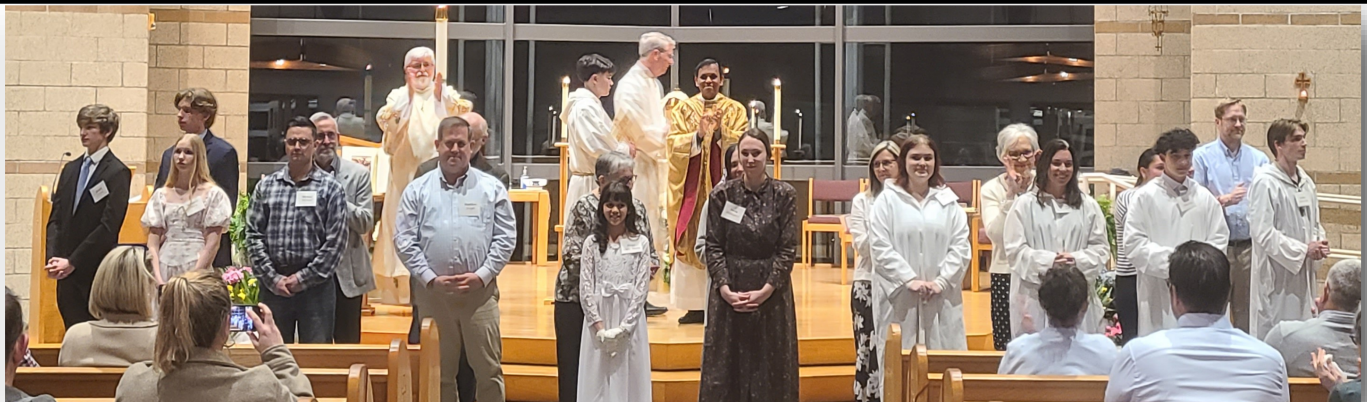
Easter Vigil Sacraments