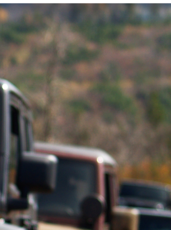
66067K 220 lb capacity / Fits 2 or 4 door

Jeep® hard tops are big, heavy and always in the way. Our new electric lifts make storing your roof a breeze. Simply back underneath, install the straps and away it goes.