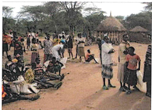
Relief Distribution at Barpello Mission