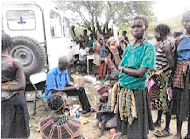
A mobile clinic in Kositei