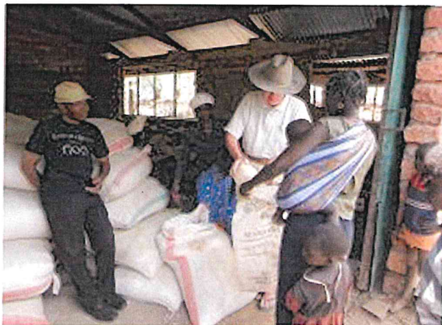
Relief Distribution at Tugumoi Mission