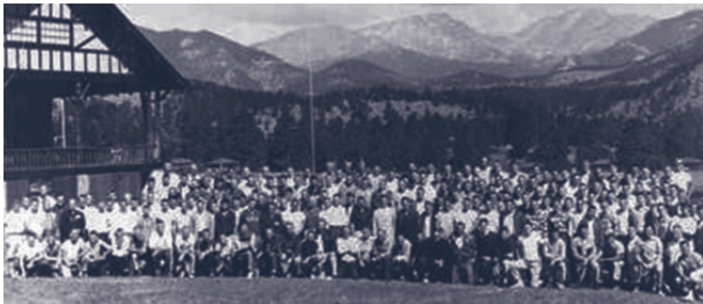
Left: A picture from Estes Park, Colorado at the first FCA Camp in 1956. FCA now hosts camps in 92 countries across the world.