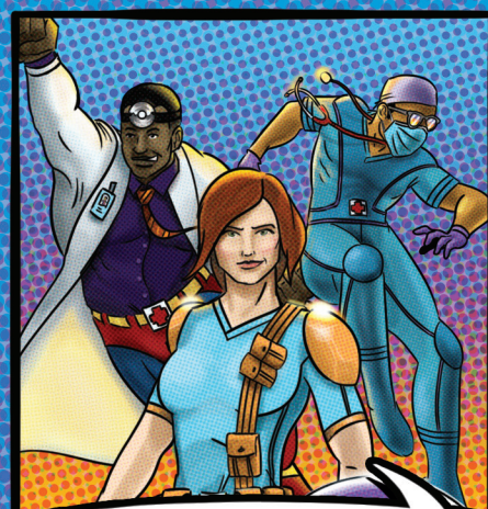
TRI-COUNTY NURSING PATHWAY CONCURRENT ENROLLMENT TEAM

Awarded to an individual or organization demonstrating significant contributions and support for the nursing profession!