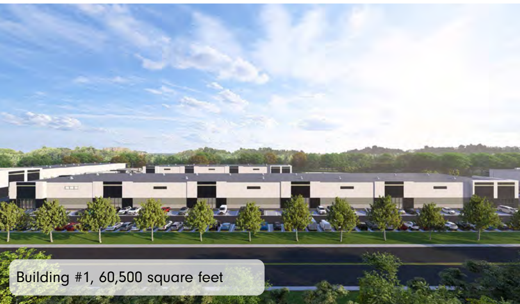
Building #1, 60,500 square feet

Narrows Industrial Park | Copperas Cove, TX