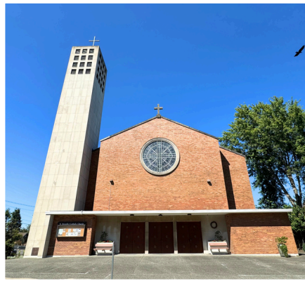
ST. BENEDICT PARISH 1805 N 49th St, Seattle, WA 98103 Website: https://parish.stbens.net