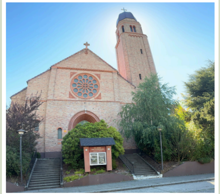
ST. JOHN THE EVANGELIST PARISH 106 N 79th St, Seattle, WA 98103 Website: https://stjohnsea.org

Parish Family Admin Office: 206-782-2810 | 206-770-6494 (Fax) | info@parishfamily14.org | 106 N 79th St, Seattle Parish Family Faith Formation Office: 206-632-0843 ext 6005 | lcorcoro@parishfamily14.org | 1805 N 49th St, Seattle