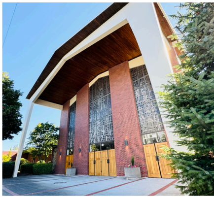
ST. ALPHONSUS PARISH 5816 15th Ave NW, Seattle, WA 98107 Website: https://stalseattle.org

Mon - Thurs: 7:00 - 7:20 AM at St. Alphonsus Thursday: 5:00 - 5:45 PM at St. Benedict Saturday: 4:00-4:45 PM at St. Alphonsus Sunday: 8:00 - 8:45 AM at St. Alphonsus Sunday: 9:45 - 10:15 AM at St. John By appointment: info@parishfamily14.org First Friday Confession and Adoration: 7:00-8:00 PM at St. Alphonsus