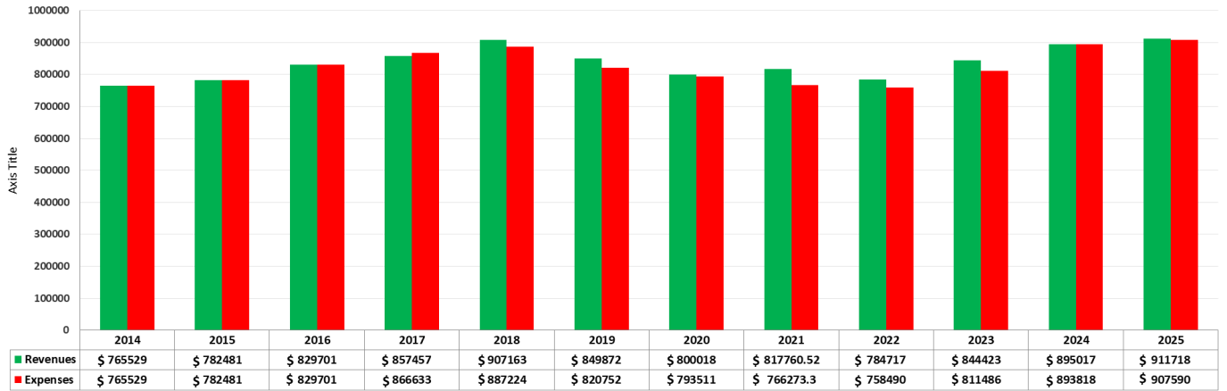
St. John the Evangelist Parish Operating Revenues 2024-2025 Total of $911,718

Revenue Excludes PPP Proceeds, Large Bequests and Other Grants