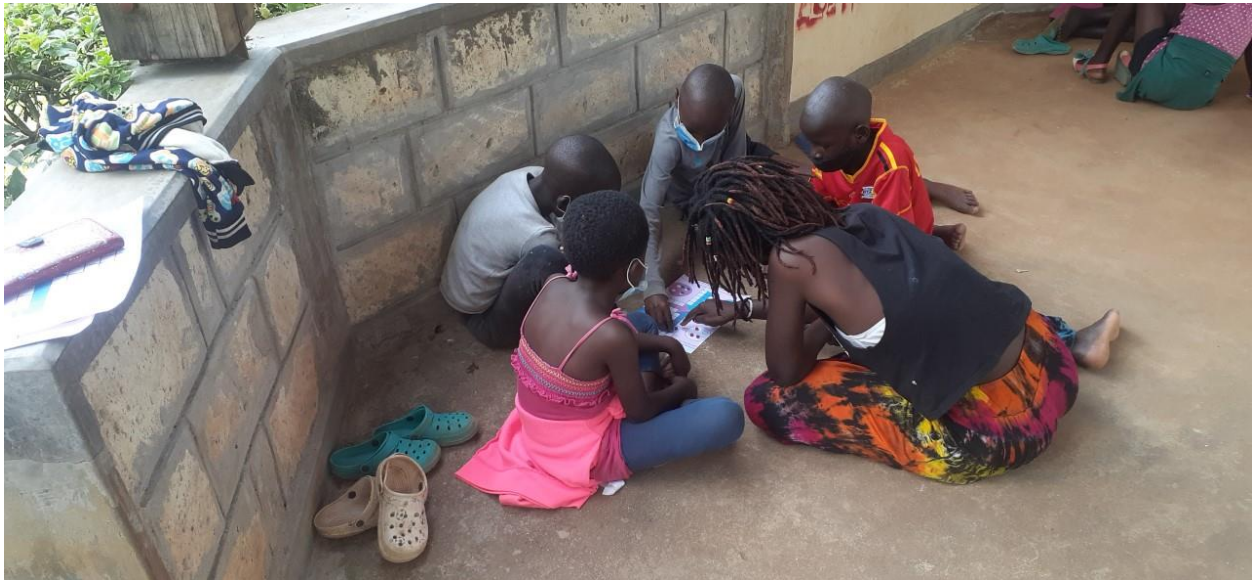
Figure 3: Teaching Sauti Kuu Youths (SKYs) how to play Ludo during PD.

During my internship period, I helped the youths in their studies. I was also able to teach them new indoor and outdoor games like Ludo and singing games such as Mingle Mingle , chair dance, and balloon dance.