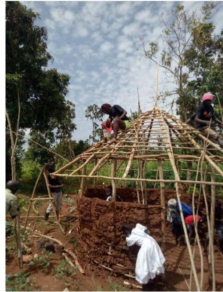
Figure 9: Helping in the roof construction in Kendo- 2 Project.