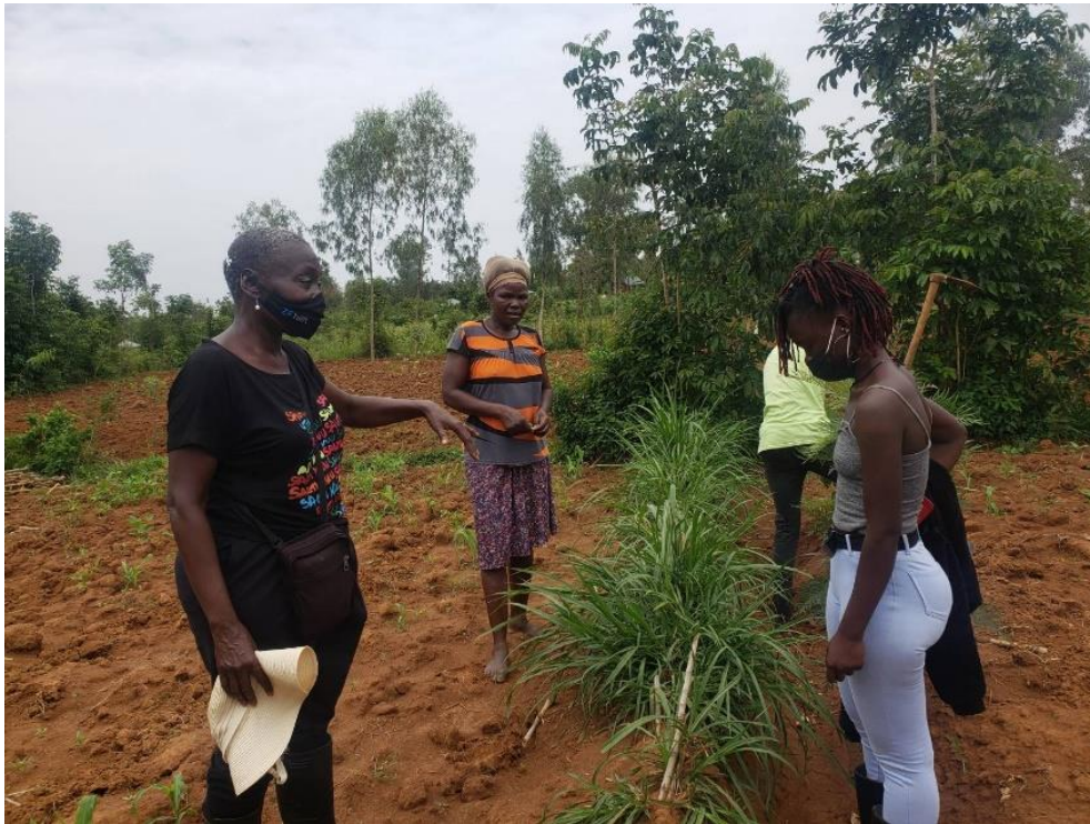
Figure 2: A visit to an SKF beneficiary's homestead.

I believe I will carry this knowledge with me wherever I go and will apply it and teach other people what I've learned in SKF.