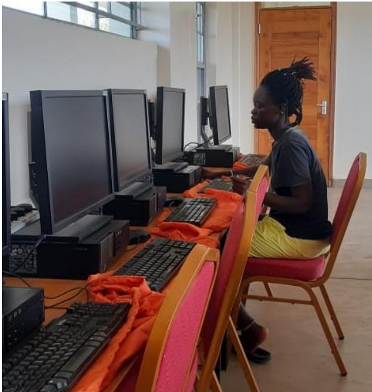
Figure 14: Working in the ICT room.