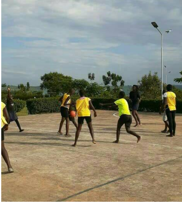
Figure 4: Playing Netball with SKYs.