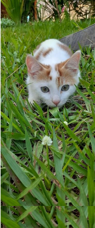
Figure 7: Mbilu, the cat I was taking care of.