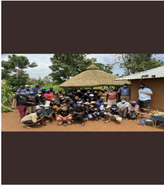
Figure 10: Kendo-2 Project, the final day.