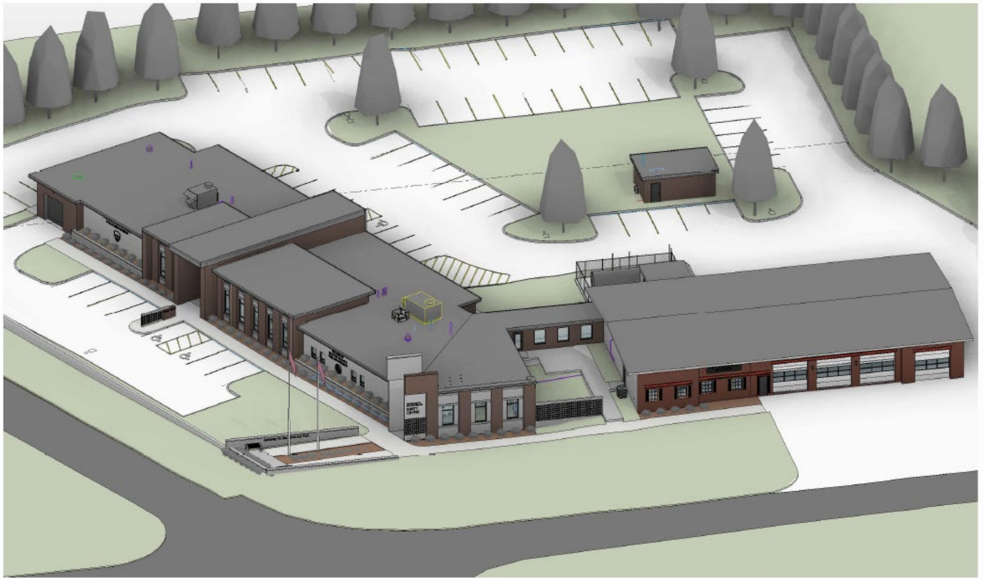
Village of Boston Heights Safety Center