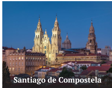
Santiago de Compostela