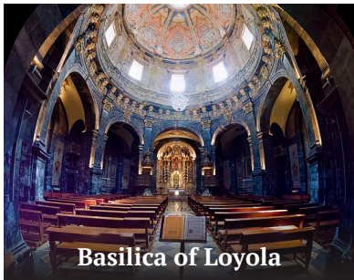
Basilica of Loyola