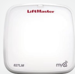
827LM myQ Remote LED Light Operates automatically with the opener and works with the myQ App.