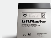
485LM Garage Door Opener Battery Integrated battery backup allows you to open and close your door even when the power is out.