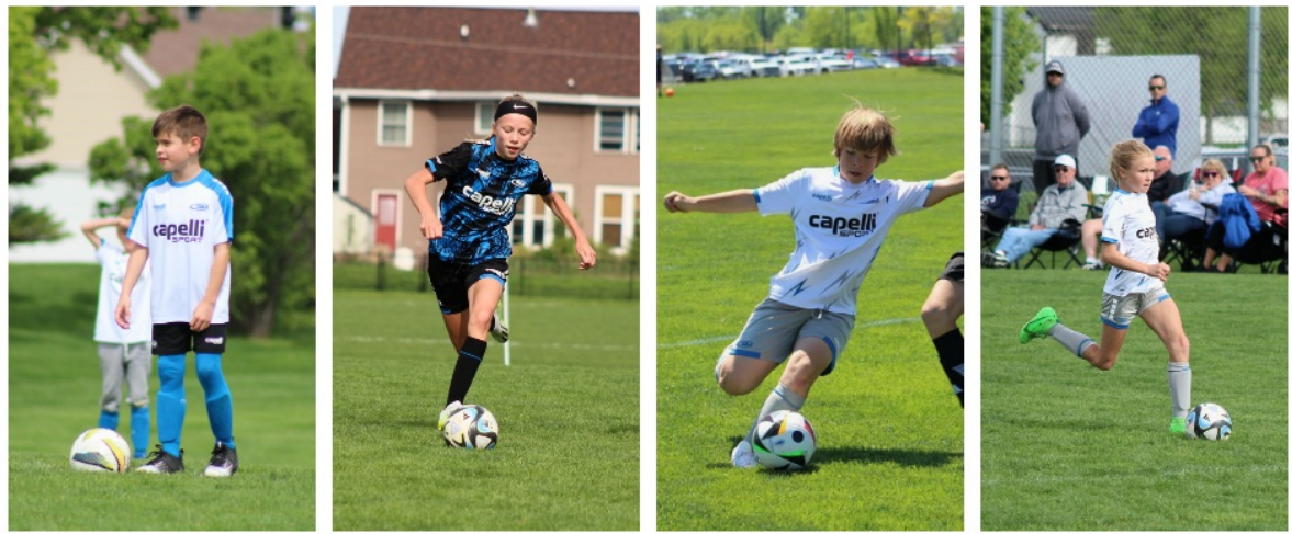
Pictured Above - Highlights from the 2024 Spring Season