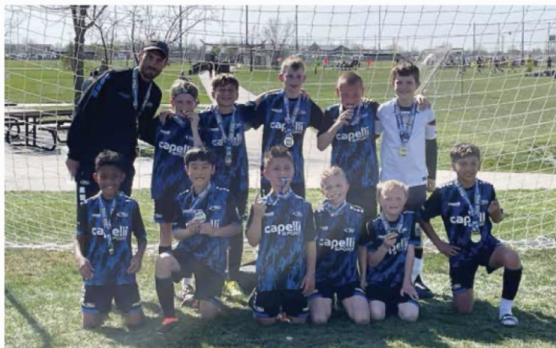
One of the winning Iowa teams from this season's Iowa Rush Spring Champions Cup tournament.