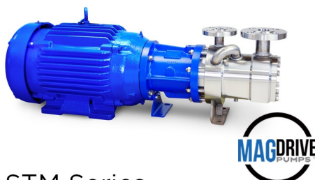
STM Series REGENERATIVE TURBINE PUMPS