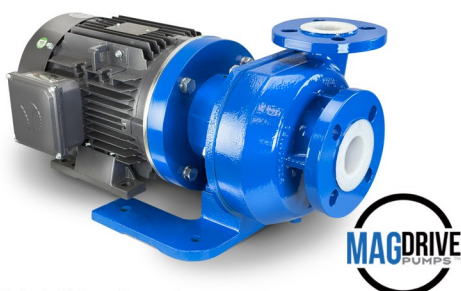
SMCL Series NON-METALLIC PROCESS PUMPS