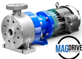
SCMA Series CENTRIFUGAL PUMPS