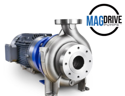
SMCA Series RETROFIT PUMPS