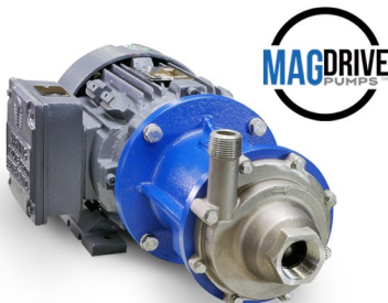
M SS Series CENTRIFUGAL PUMPS