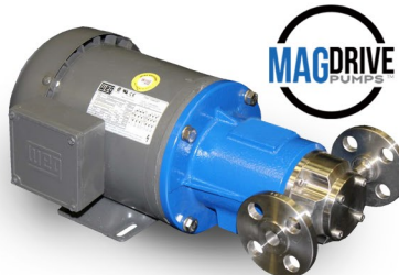
SVM Series VANE PUMPS