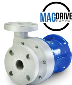
SCMP Series CENTRIFUGAL PUMPS