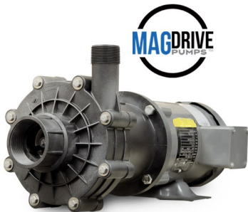
M Series CENTRIFUGAL PUMPS