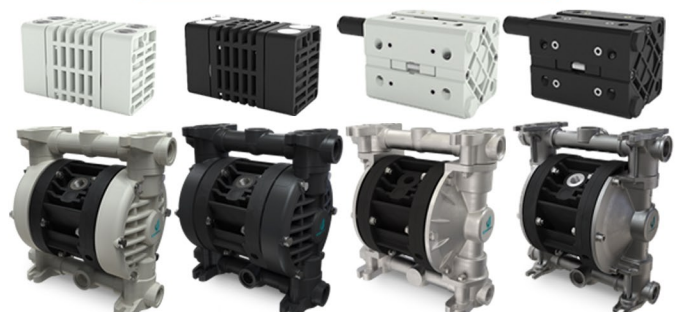
Diaphragm Series - Cube & BXR DIAPHRAGM PROCESS PUMPS