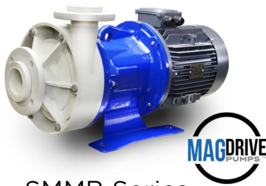
SMMB Series CENTRIFUGAL PUMPS