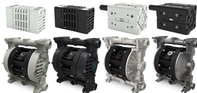
Diaphragm Series - Cube & BXR DIAPHRAGM PROCESS PUMPS