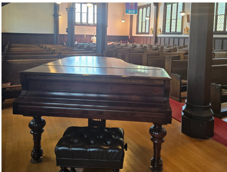
Our piano and space are also available for recitals and concerts