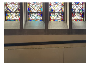
Area under stained glass window in columbarium transept