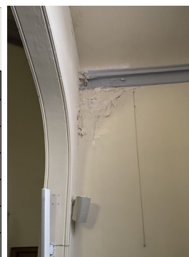
Wall before repairs