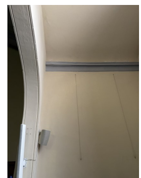
Wall after repairs