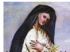
St. Kateri Tekakwitha

Financial assistance please call 401-258-5773