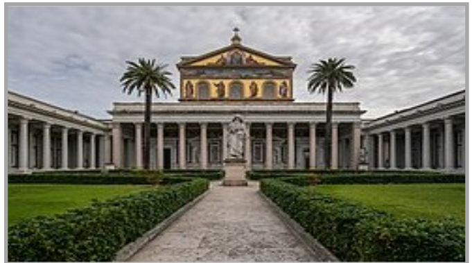
The Basilica of Saint Paul Outside the Walls, with a statue of St. Paul standing in front

The Dedication of the Basilicas of the Apostles Peter and Paul is a feast day on the liturgical calendar of the Catholic Church, which is celebrated on 18 November .