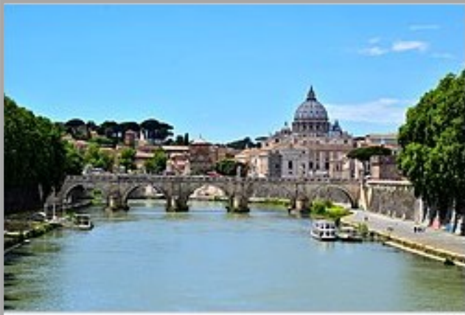
St. Peter's Basilica seen from the Tiber