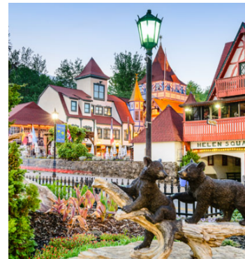
OCTOBERFEST Helen, GA Sept 12 - Oct 29

CLICK HERE FOR MORE IDEAS AND INFORMATION ABOUT FALL ACTIVITIES