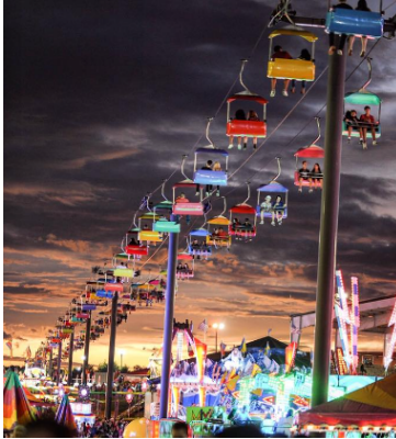
CUMMING COUNTRY FAIR & FESTIVAL, Cumming, GA

Now that the summer heat is finally behind us, autumn beckons with its splendid outdoor opportunities for quality time with loved ones. Below are some fantastic ideas for activities and destinations to make the most of this beautiful season.