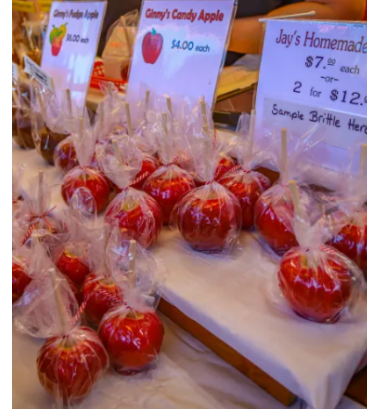
GEORGIA APPLE FESTIVAL IN Ellijay, GA Oct 8-9, 15-16, 2023