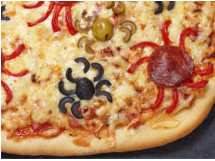
SPOOKY SPIDER HALLOWEEN PIZZA (Click for recipe)