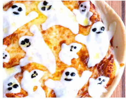
HALLOWEEN GHOST PIZZA (Click for recipe)