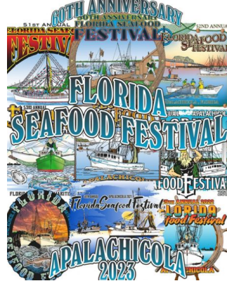
FLORIDA SEAFOOD FESTIVAL Apalachicola, FL November 3 & 4, 2023