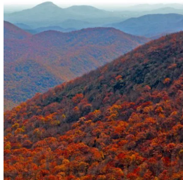
VISIT BRASSTOWN BALD Hiawassee, GA Oct - Nov 2023