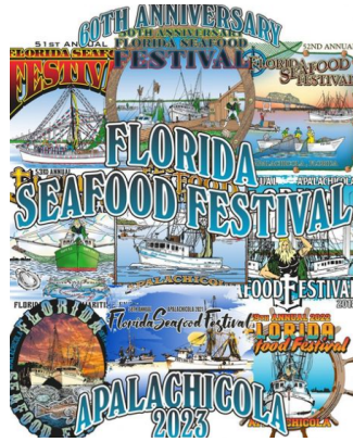
FLORIDA SEAFOOD FESTIVAL Apalachicola, FL November 3 & 4, 2023