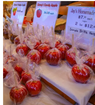
GEORGIA APPLE FESTIVAL IN Ellijay, GA Oct 8-9, 15-16, 2023