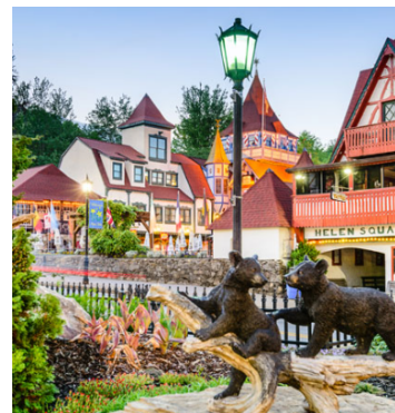
OCTOBERFEST Helen, GA Sept 12 - Oct 29

CLICK HERE FOR MORE IDEAS AND INFORMATION ABOUT FALL ACTIVITIES