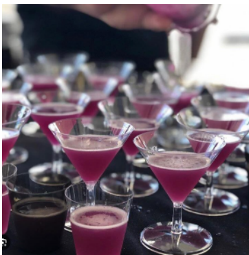
SAVOR ST. PETE Tampa Bay, Florida Nov 4-5, 2023