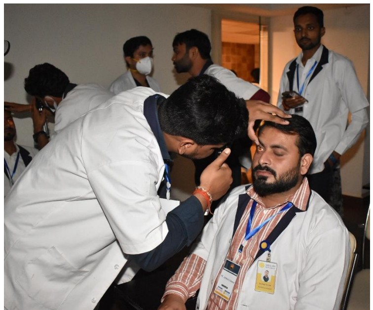
Image 2: OA/ON training organized in collaboration with Sadguru Netra Chikitsalaya and supported by Sunsure Energy.

An Ophthalmic Assistant (OA) training program conducted at Sitapur Eye Hospital engaged 22 OAs and achieved a Net Promoter Score (NPS) of 90, reflecting high levels of participant satisfaction and engagement. Building on this momentum, a three-day OA training program was conducted in Chitrakoot, Madhya Pradesh, in collaboration with Sadguru Netra Chikitsalaya and supported by Sunsure Energy Pvt. Ltd. The training reached 60 Ophthalmic Assistants and achieved a 100% Net Promoter Score, demonstrating the relevance, quality, and effectiveness of the training model.