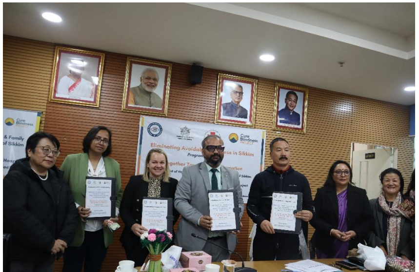
Image 4: Memorandum of Understanding between the Department of Health & Family Welfare, Government of Sikkim, Siliguri Greater Lions Eye Hospital, and Cure Blindness Project.

Under the partnership, more than 650 Community Health Workers will be trained, 55 Ophthalmic Assistants will receive specialised training, and more than 5,500 cataract and sub-specialty surgeries are expected to be supported in the coming years.