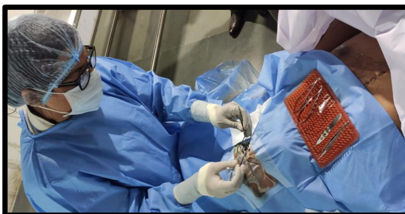
Technician assessed while performing Eye recovery during audit at MGRC -Sahiyara Eye Bank

Monitoring & Evaluation (MEAL) activities continued uninterrupted, with regular project data collection, analysis, and reporting to guide program decisions.