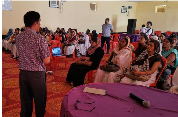
Refresher training in progress under the program