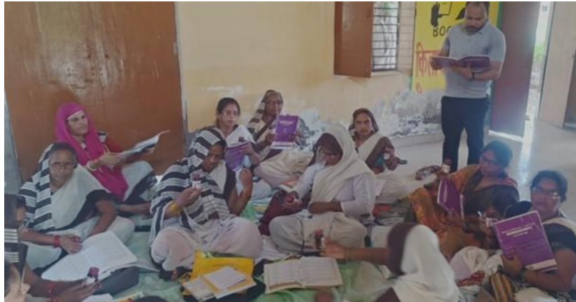
CHWs in regular meeting with project supervisor

This year's success underscores the effectiveness of training, empowerment, and responsive management of our CHW network.