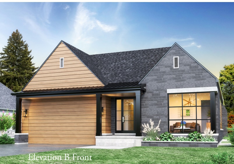
Elevation B Front