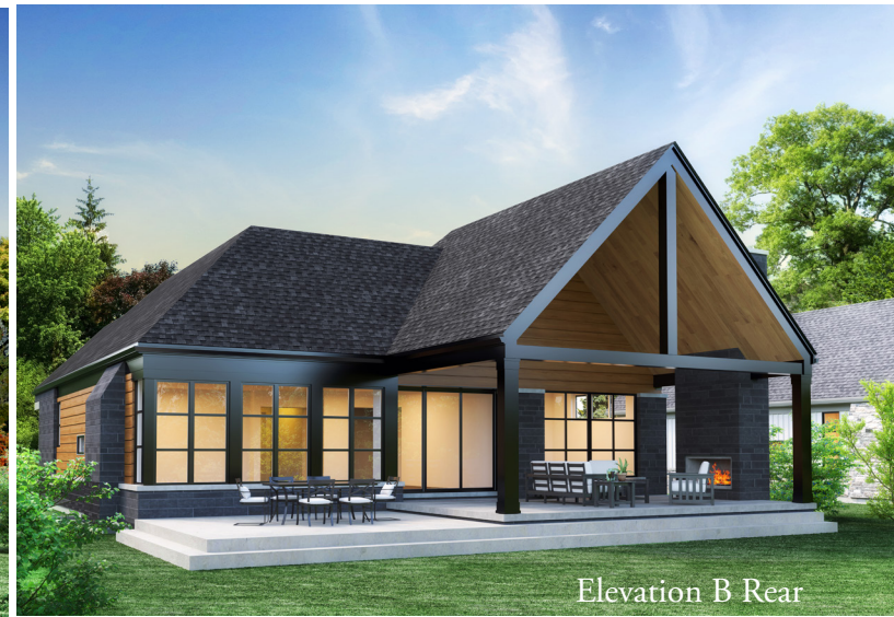
Elevation B Rear