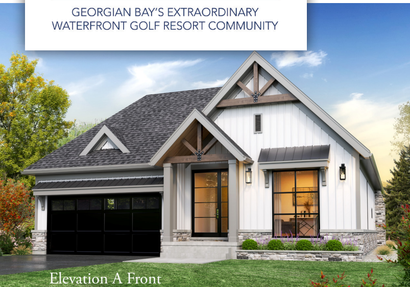
Elevation A Front

THE CARRICK DETACHED BUNGALOW | 1,922 SQ. FT