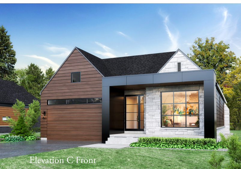
Elevation C Front