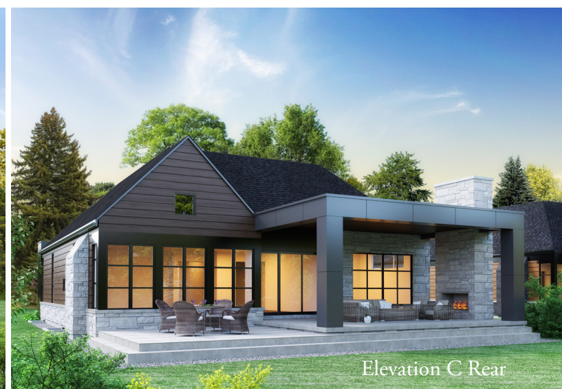
Elevation C Rear