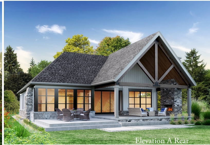
Elevation A Rear