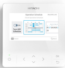
Ultimate control meets award-winning design in the Advanced Color Controller.