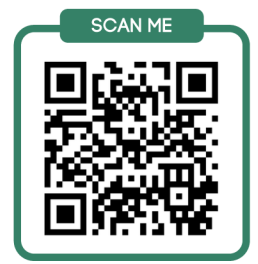
SJOW Sacrificial Giving