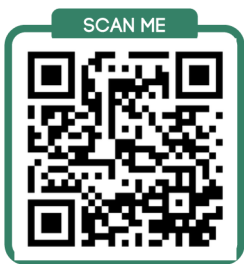
PSJ Sacrificial Giving

Sunday: $ 3,299 Online: $845.88 Loose: $1,081.21 Total: $5,226.09