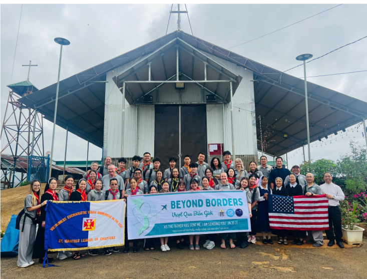
Photo: mission work at Son Dien Parish, Dalat Diocese

Thanks to your generous support, our Mission Trip 2025: Beyond Borders in Vietnam was safe and successful. Your donation made a significant difference. Thank you!