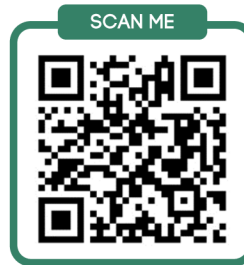
Food Bank Donation