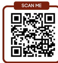
St. Rita Sacrificial Giving