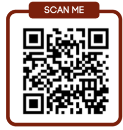
SJOW Sacrificial Giving