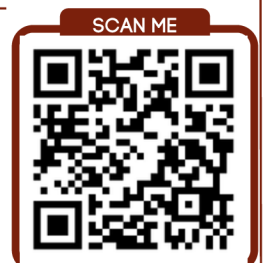
Other Parish Forms

You can register at Pope St. John XXIII Parish. By registering, you will be added to our parish database and included in all communications coming from the Parish. If your child will be making the Sacrament of First Eucharist or Confirmation this year, please make sure to register them through the Parish. All the forms can be found on the parish website or you can scan this code: