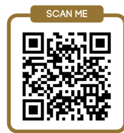
SJOW Sacrificial Giving